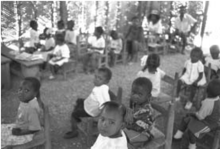
The ECCD field needs to address how other fields and sectors might more effectively ensure that children are at the centre of the social agenda.

We need to become adept at using economic analysis regarding the very considerable returns on investment in ECCD, such as that done by Mingat and Jaramillo, when making the case for ECCD with regard to achieving Millennium Development Goals (and EFA goals) within our own settings. Using data from twenty-four African countries Mingat and Jaramillo estimate that the impact of ECCD on student flow (the number of years it takes for a child to complete the primary cycle) would result in a gain of 20% in the efficiency in resource use. Twenty percent of a six-year cycle amounts to a gain equivalent to 1.2 years of schooling. This means that if a year of preschool costs anything up to 1.2 times what a year of school costs, there would still be a net saving just within the education system (let alone looking at the broader and longer-term benefits as the other economic analyses we have looked at have done). Using these kinds of figures helps policy-makers to see the implications of ECCD for: