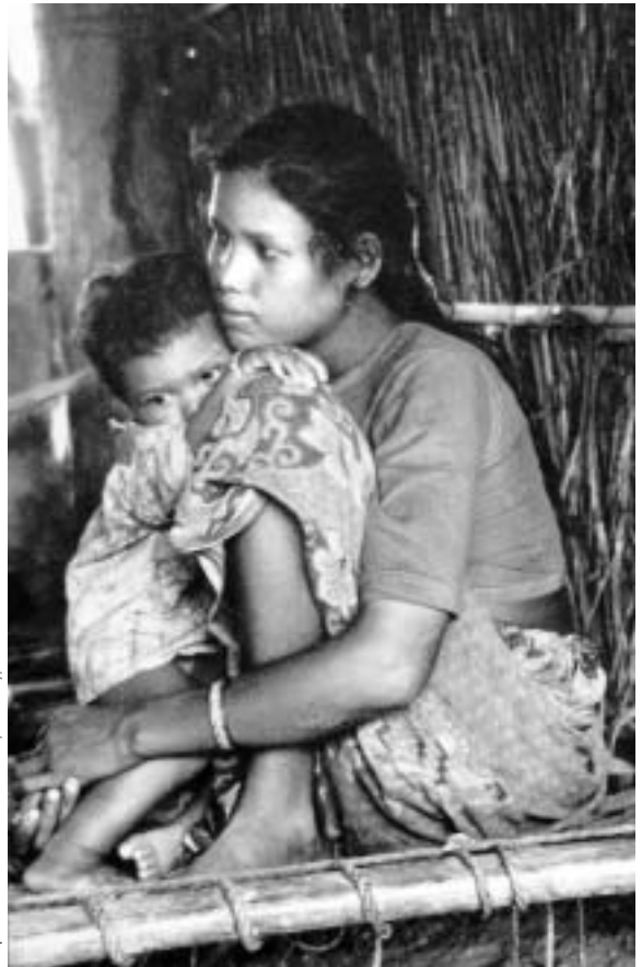
Nepal

impact on education indicators, the fit with existing priorities and commitments, implications for future policy and programmes, and ways in which these can be affordable