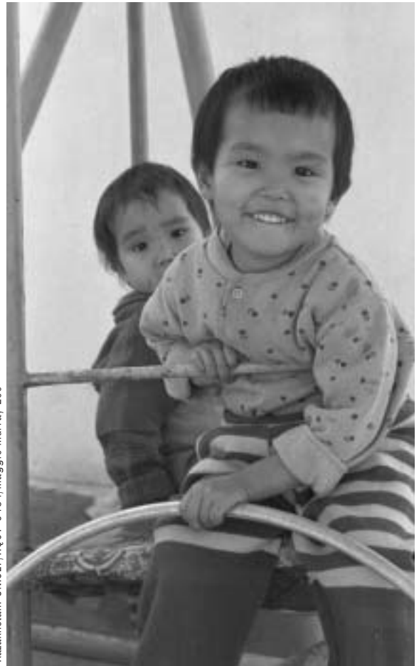
Kazakhstan: UNICEF/H097-0484/Maggie Murray-Lee

UNESCO's December 2003 policy brief examines the issue of equal access to early childhood care and