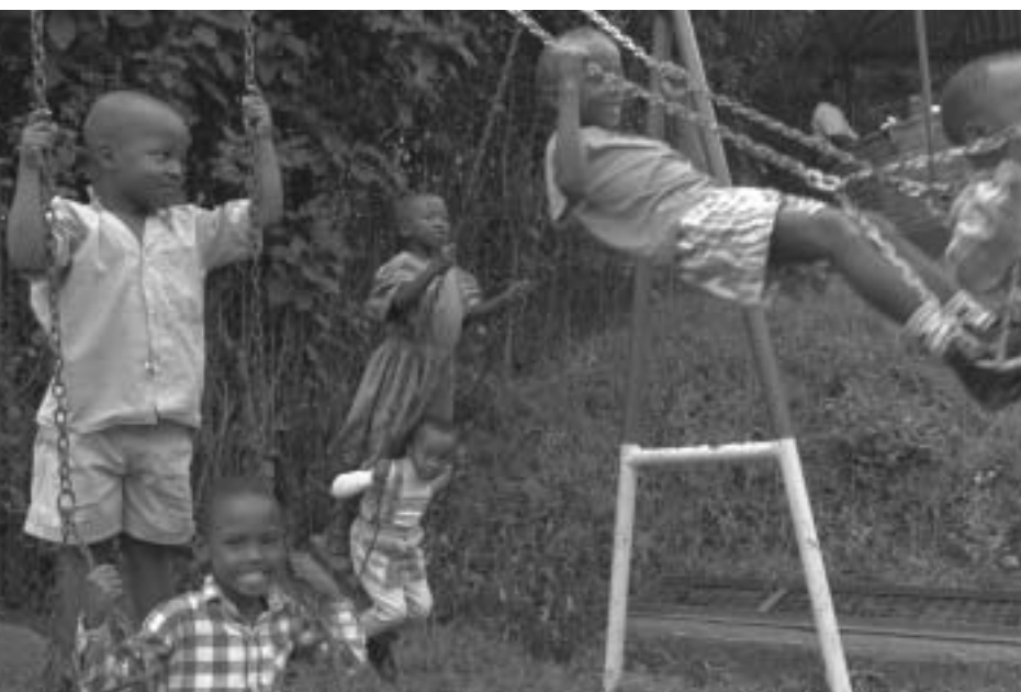
Rwanda

children's academic skills (but which fail to address a child's holistic developmental needs); childcare programmes that do not really have curricular components; birth registration efforts that are focussed more on numbers than on the opportunity to make sure that the conditions into which the infants are born are adequately supported.