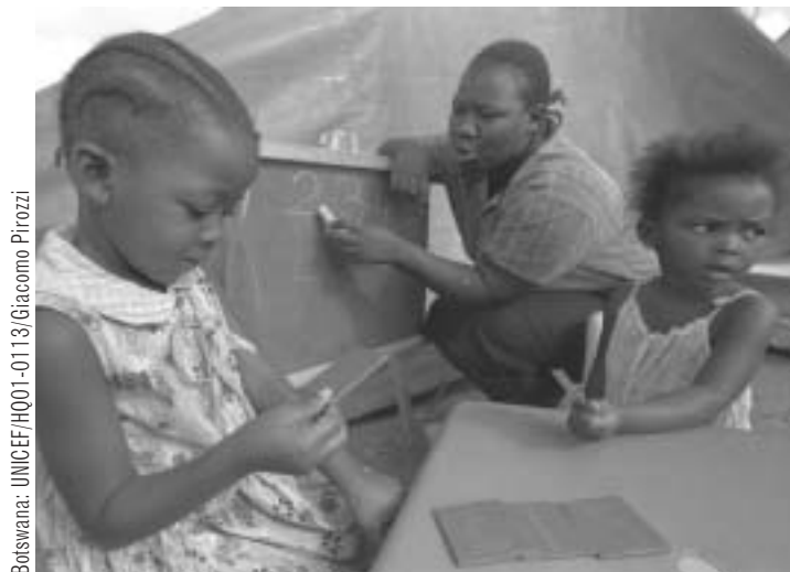
Botswana: UNICEF/HQ01-0113/Giacomo Pirozzi