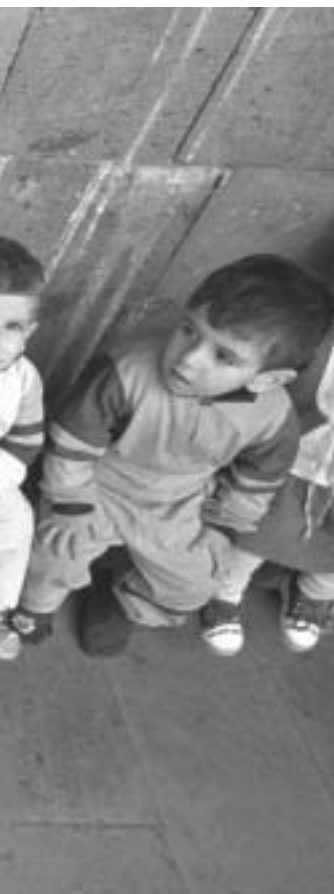
Armenia