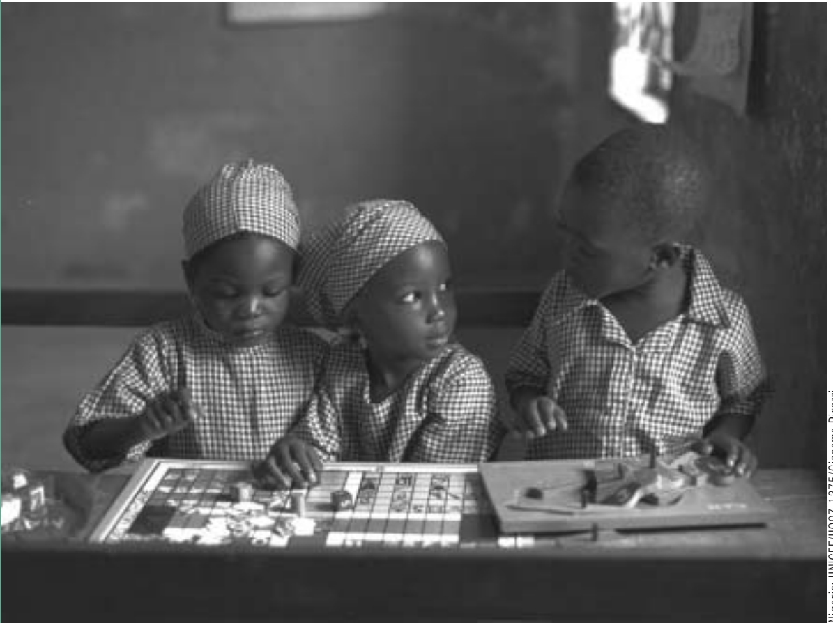
Nigeria: UNICEF/HQ97-1375/Giacomo Pirozzi