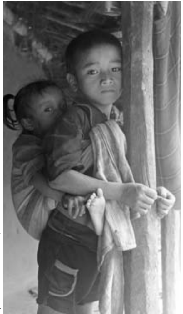
Nepal: Save the Children US/Norway

The most disadvantaged children experience the most dramatic developmental gains from ECCD.