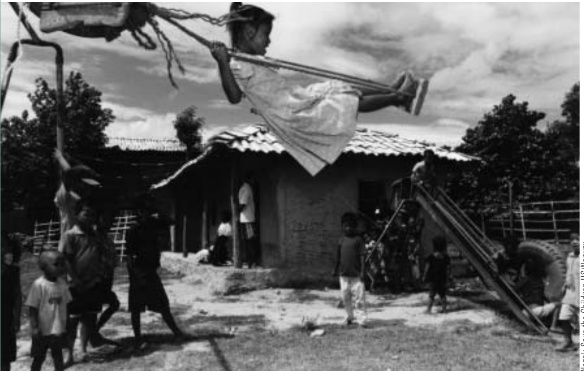
Nepal: Save the Children US/Norway

Since March 2001, Speak for the Child has been supporting the community of South Kabras in Kenya's Western Province in improving the health, nutrition, education, and emotional well-being of young children orphaned and made vulnerable by HIV/AIDS. As of December 2003, Speak for the Child services 339 children ages five years and under. Key programme components are immunizations, preschool, regular home-visits, and support groups for community mentors and caregivers.