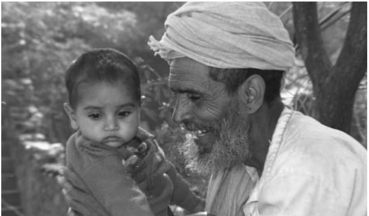
ECCD includes family, non-formal, community-owned and community-based initiatives.

It is not helpful to romanticize the way families and communities operate. There are issues to be addressed and we recognize that families face very real