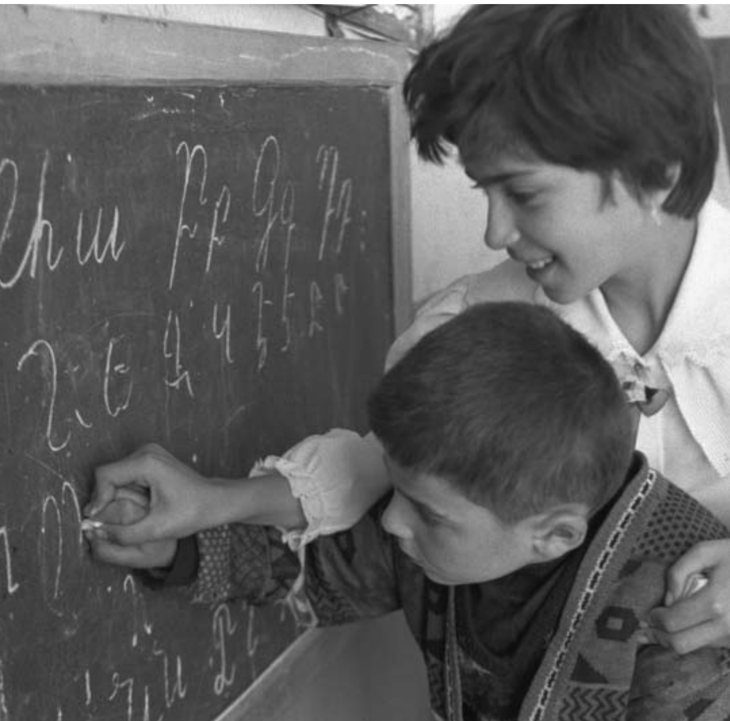
Armenia