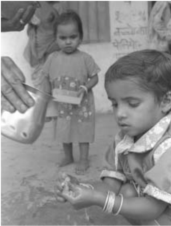
Services and supports need to converge at the level of the child.

child, international agencies might do better to acknowledge that ministries ARE sectoral and that what matters is that children have access to services and supports. Rather than always pushing for multi-sectoral integrated projects, we need to also recognize that it is fine if, for example, a child: