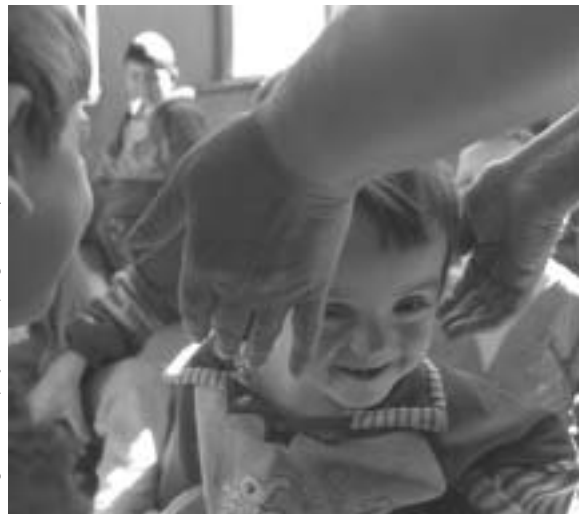
Georgia: UNICEF/HQ97-0612/Roger Lemoyne

Economists analysing ECCD programmes acknowledge that although programmes are indeed concerned with broader social dimensions such as equity, justice, conflict resolution, and a caring society, it is difficult to assign a numerical value or put a price on many of these critical benefits of ECCD. As Myers points out, Common sense suggests that the early years—when the brain matures, when we first learn to walk and talk, when self-control begins and when the first social relationships are formed—must be regarded as important. Common sense suggests that children whose basic health, nutritional, and psychosocial needs are being met will develop and perform better than those who are not so fortunate. Common sense also suggests that a child who develops well physically, mentally, socially