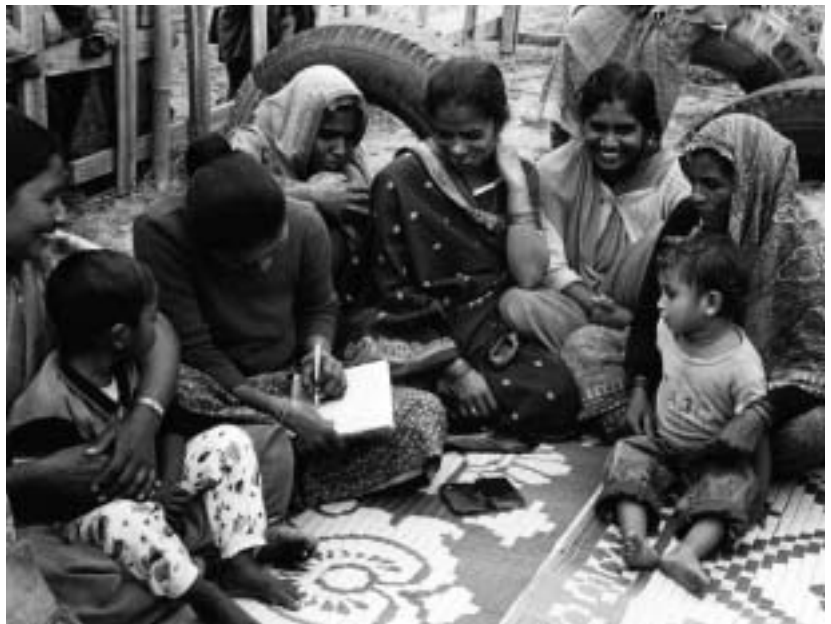
Nepal: Save the Children US/Norway

Newer approaches to parenting programmes include providing parents with knowledge and strategies to change systems that marginalize/exclude certain children.