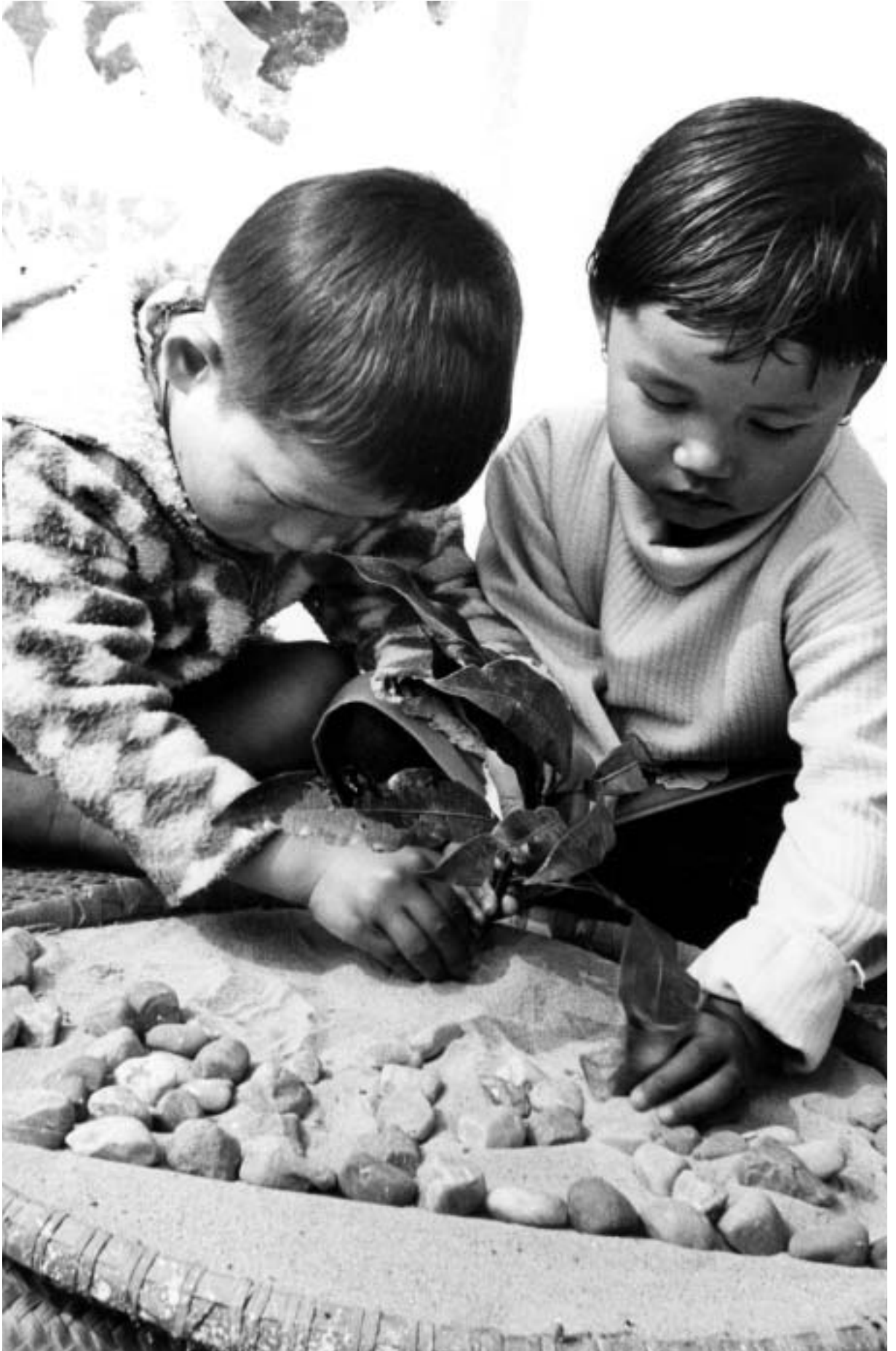
Nepal: Save the Children US/Norway/UK