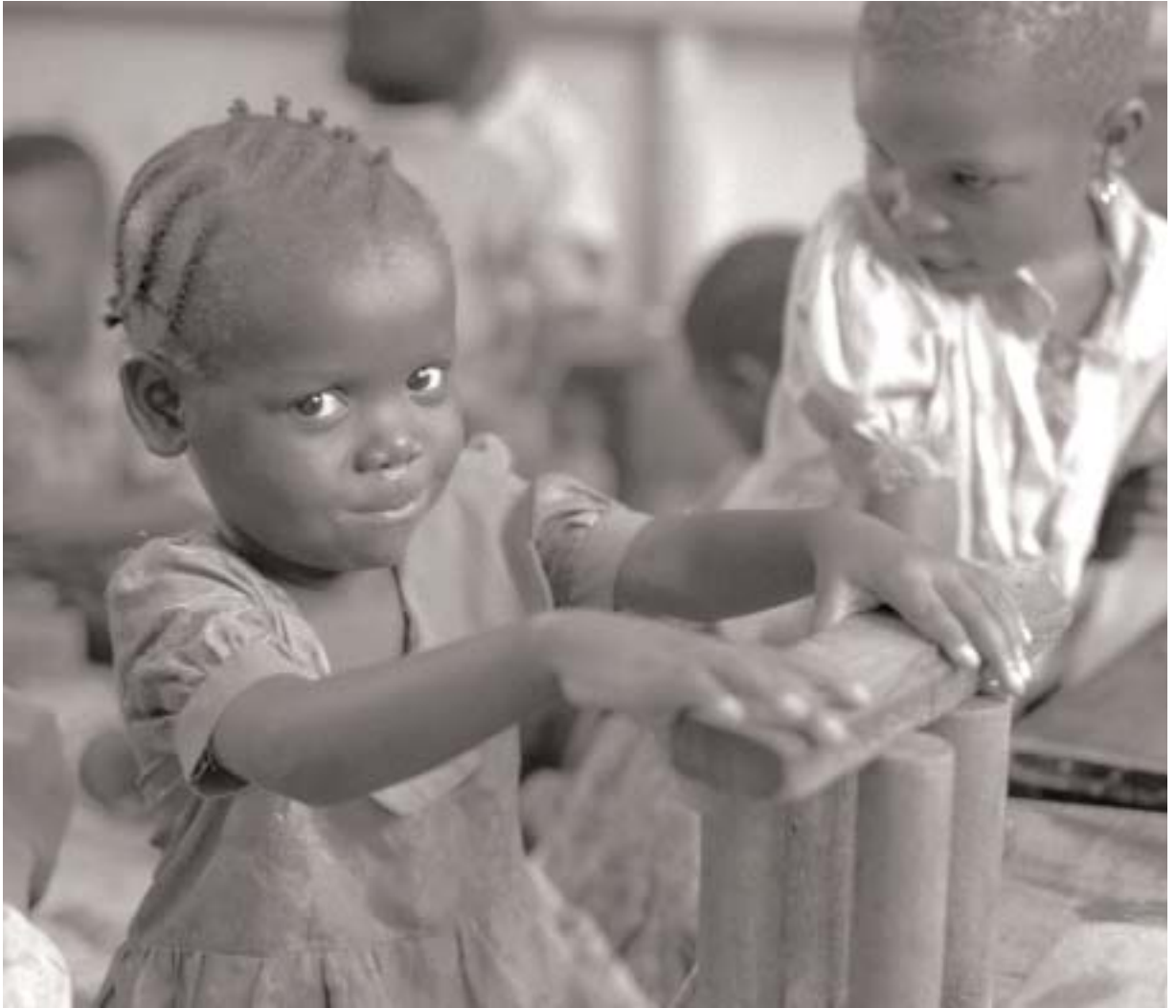
Mombasa: UNICEF/HQ96-1431/Giacomo Pirozzi