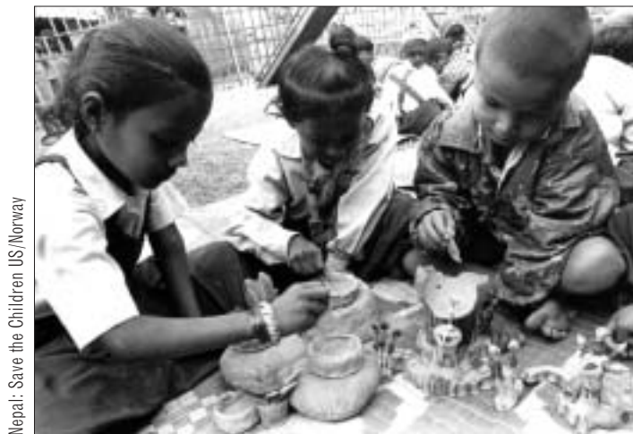
Nepal: Save the Children US/Norway