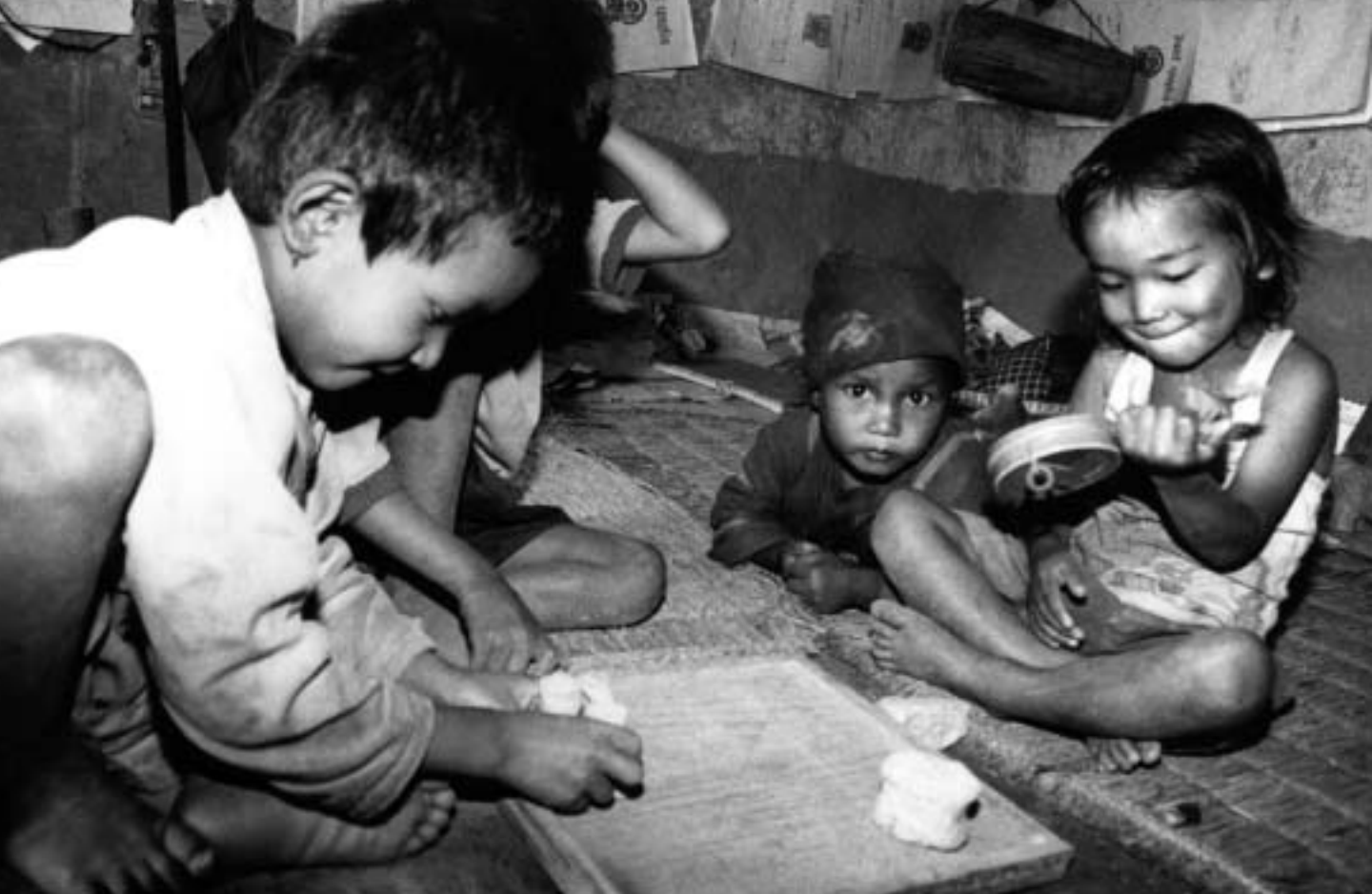
Low cost programmes can provide quality learning and development opportunities.

Interestingly, some studies suggest that ECCD programmes yield long-term benefits regardless of the level of support in school, and even when the quality of schooling is low. 18 The highly regarded Abecedarian study (1999) mentioned earlier in this article, using a two by two crossover design, looked at not only programme children and a control group, but also at the effects of intensive supports during the first three years of school. Researchers concluded at the fifteen year point that the ECCD programme had been almost as effective alone (in terms of children's achievement) as combining it with the enhanced primary school experience, and was definitely more effective than the primary school enhancement alone. This is an interesting finding that has not received adequate attention. From a pure investment point of view, it argues for greatly increased resources to be allocated to ECCD programmes.