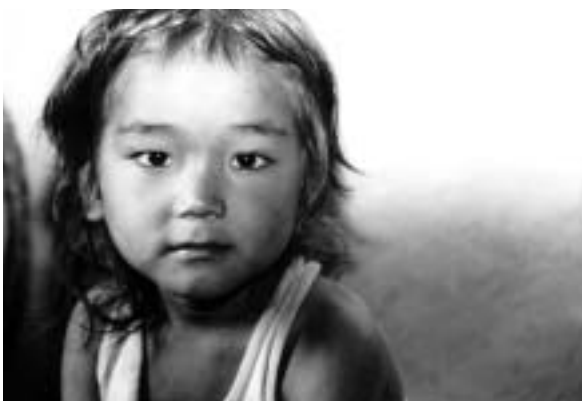
ECCD is a first and essential step towards achieving the Millennium Development Goals.

As the World Bank economists Van der Gaag and Tan (1998) state, "Providing ECCD programs is a powerful way to break the intergenerational cycle of poverty." Poverty Reduction Strategy Papers are a major driving force for individual countries as they create development policies. Therefore we need to undertake analysis of these documents within the context of our own settings in order to make explicit and communicate to decision-makers the key contributions that ECCD can make.