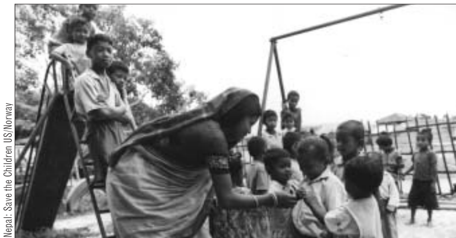
Nepal: Save the Children US/Norway

As might be expected from children who are both better prepared and more regular in attendance, their success in year-end examinations is dramatically better. In 2000, SC collected data on the pass rates of children in the schools in twenty-four VDCs in Siraha. Using this data in combination with data on 261 ECD children who attended some twenty of these schools during that year, it was possible to compare passing rates in grades one and two 4 for the ECD children and their classmates. In grade one, 81% of the ECD children passed, as compared to 61% of their non-ECD classmates. In grade two, 94% of the ECD children passed as compared to 68% of their non-ECD peers. 5 There is virtually no probability that these differences were due to chance rather than to the ECD programme ( p=0.000053 for grades one and two combined.) This one-year snapshot demonstrates the significant support that ECD can provide to children in their early years of school.