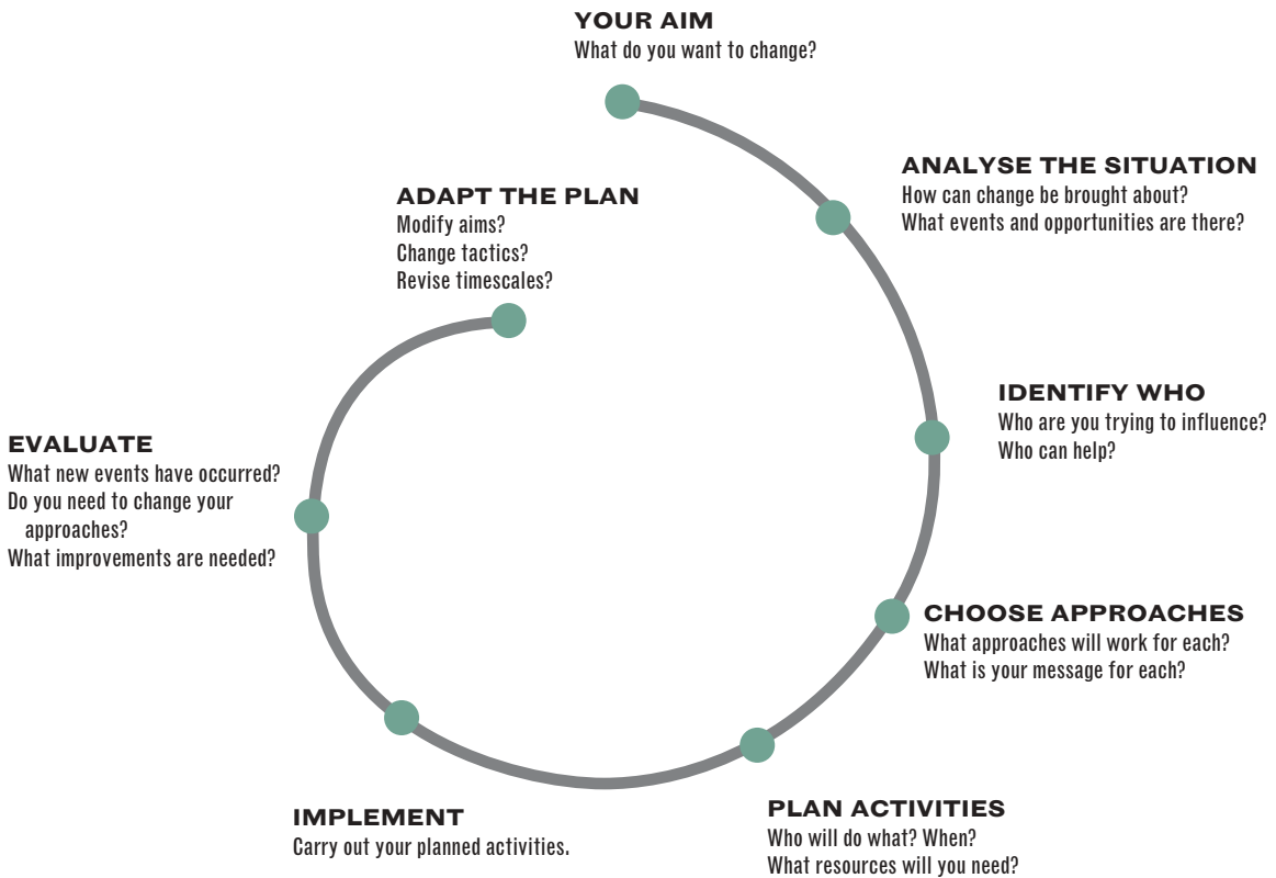
FIGURE 1—ADVOCACY SPIRAL

Working for Change in Education, Save the Children (UK) 2000.