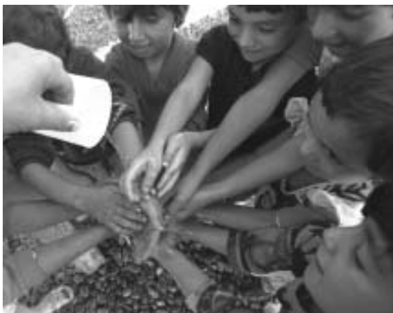
Azerbaijan: UNICEF/H097-0858/Roger Lemoyne

Many of the answers to why more isn't happening for young children are enmeshed in global macro-economic trends that together conspire to marginalize social services. Despite the potential that globalization offers for the dispersion of knowledge and wealth, it appears in fact to be increasing the gap between rich and poor. Economic growth has failed to reduce poverty in most nations. 20 More and more children are being born into poverty. Structural adjustment programmes have resulted in tremendous spending constraints. These have had dire consequences for the poor, especially poor children, because of the cuts in social spending. Loans that were meant to lift countries out of poverty have instead dragged them further into debt. In the poorest nations, money that is needed for education and health is spent on debt repayment. Many countries spend more on debt servicing than on basic social services. For example, in Tanzania nearly 50% of the budget goes to external debt and 10% to social services. Debt relief (the Heavily Indebted Poor Countries (HIPC) Initiative) has progressed slowly.