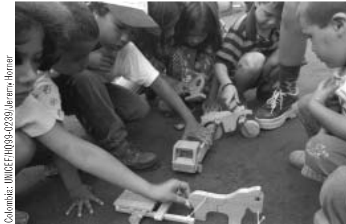
Colombia

Summary of a Presentation Made at the Christian Children's Fund's Conference, November 2003